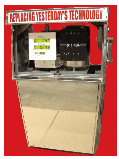
By replacing Mechanical Computer as on right with Eliminator 6.0 retrofit head, as on the left

The Eliminator 6.0 can also be used in propane, natural gas and aviation fuel applications.