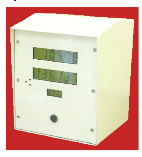
Head Shown in Bulk Meter Mount

The audit features in programming are sealable so any metrological data meets government Weights and Measures requirements.